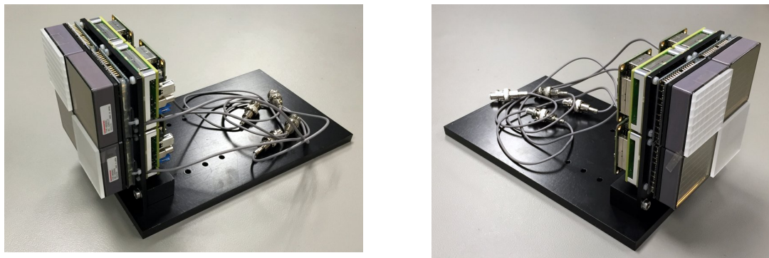
Fig. 2. Images of a mounted 2x2 demonstrator module. Different scintillator glasses are mounted for testing and comparison. The controller board has all connectors to the backend for data and electricity. The cables shown are for the high voltage supply of the MaPMTs.

The 2x2 demonstrator enables us to show the feasibility of all components of the SoNDe detector technology, such as modularity, interconnectivity and synchronicity between the single modules. Thus, it is a major step towards a full-scale detector following the same concept.